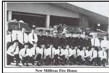
New Millbrae Fire House

Millbrae's population was growing fast after World War II, and the 25x55-foot fire house building on Broadway was getting obsolete. After two failed bond elections, Millbrae