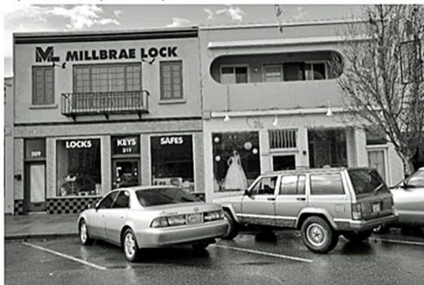
Millbrae Now and Then A pictorial trip to the past