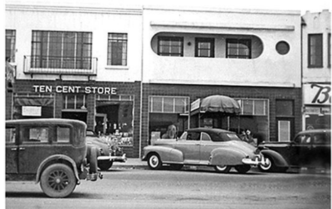
El Camino Real between La Cruz and Hillcrest Blvd. In 1946 Millbrae Lock was a Five & Dime Store